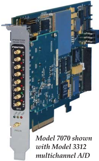
Model 7070 shown with Model 3312 multichannel A/D & D/A FMC module