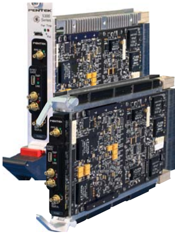
Model 52741 COTS (left) and rugged version